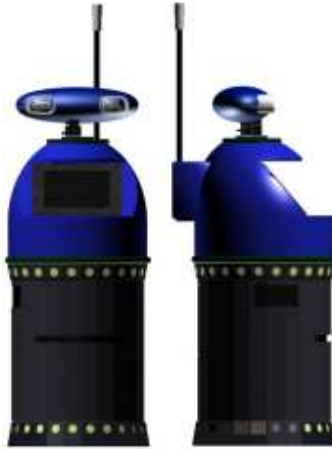
Figure 1: Front and side views of Eldi