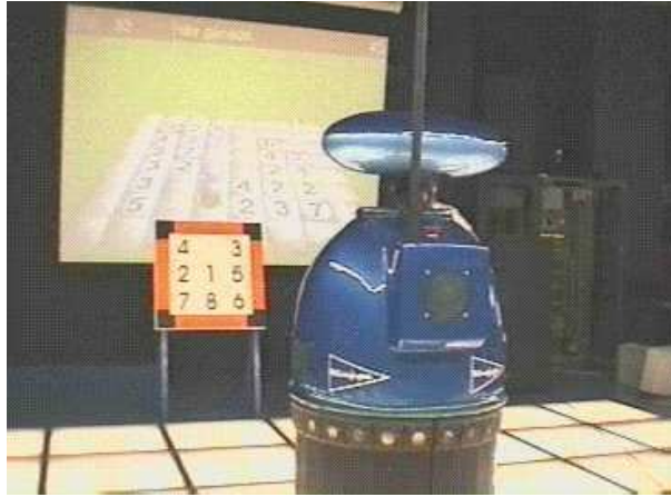
Figure 5: eldi solving the puzzle