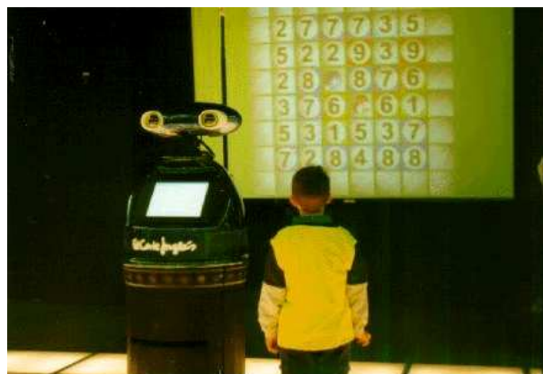
Figure 4: Frame of Treasure Search game

Currently, the daily activity of the robot cycles between a show that is carried out over a back lighted 8x8 glass board. Over that board (the Real Board) Eldi develops several shows and plays different games as “Treasure search”, figure 4, or interacts with a visitor to solve an instance of an 8-puzzle, figure 5, using vision and commanding each new movement using voice. Additionally it performs a choreography combining music, video and game board light effects. Furthermore, there is a resting period while eldi recharges batteries and offers the public the opportunity either to play different games as mastermind, chess or four-in-a-line, or to learn more about robotics using the multimedia information system and the tactile screen on its “torso”. Some of the available games has been programmed to offer the opponent explanations of the actions taken by the robot during the course of the game or to give comments that reflect the judgement of the robot about player’s actions.